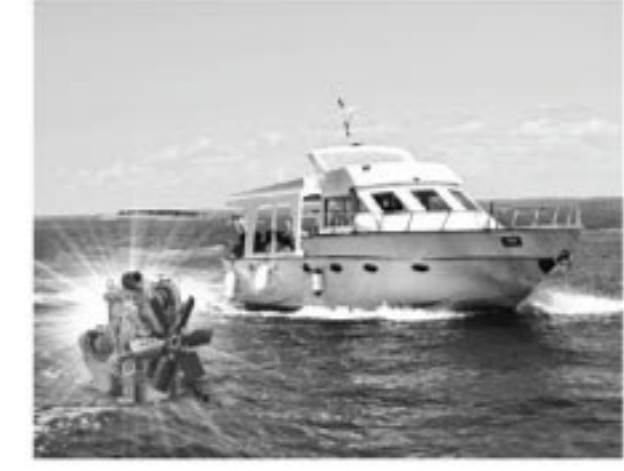
Engines of Growth