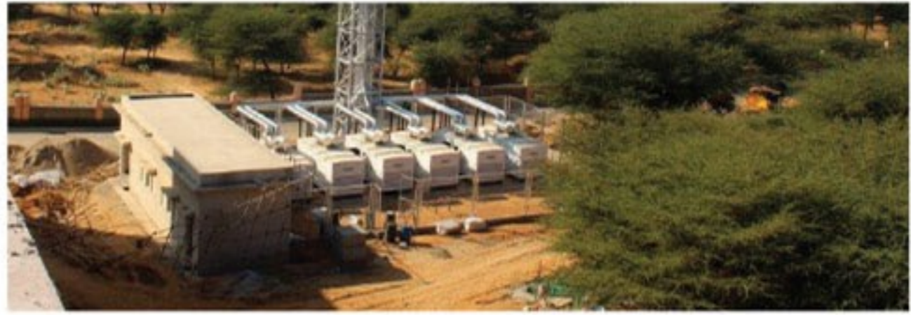
Supporting Large Infrastructure Projects